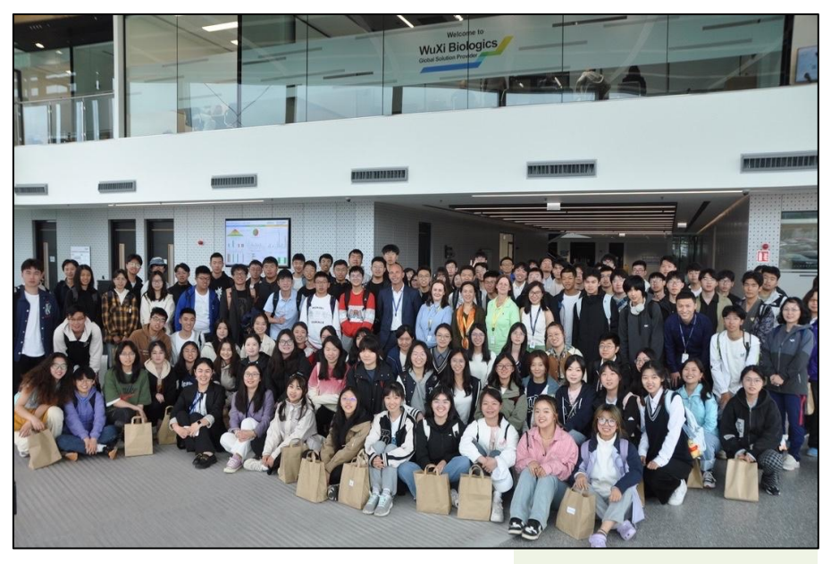
Visit to WuXi Biologics