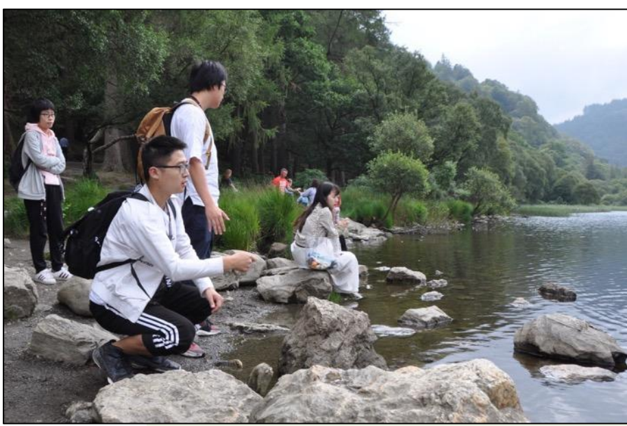
Weekend visit to historic and scenic Glendalough